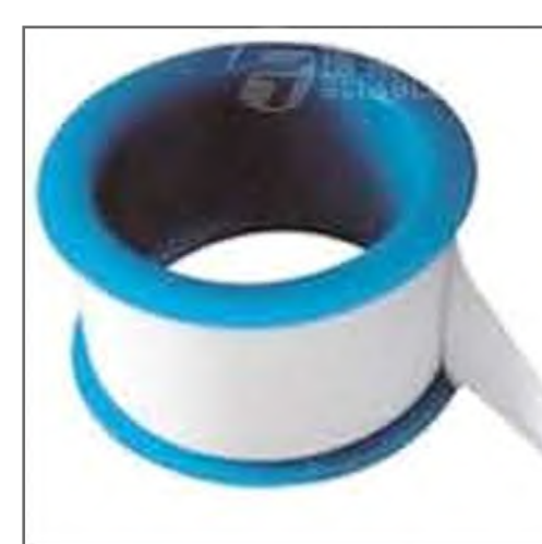
Raw material belt