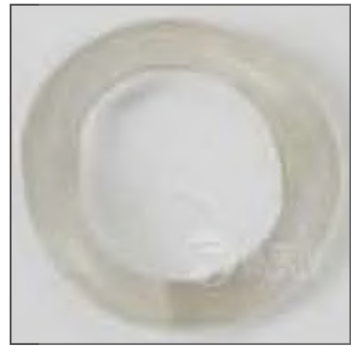
Seals for metal pipe