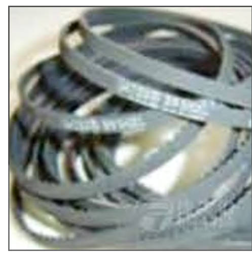
Whole sets of Belt