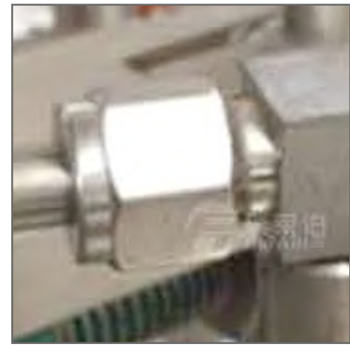
Plug & pipe for water separator