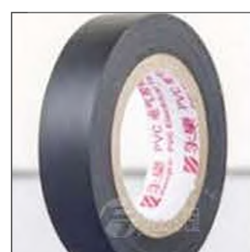
Electric knife tap