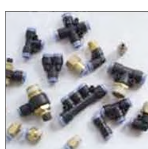
Air pipe connection