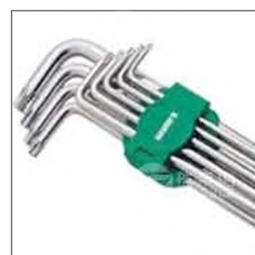
Inner hexagonal wrench (5,6,8,19,12mm)