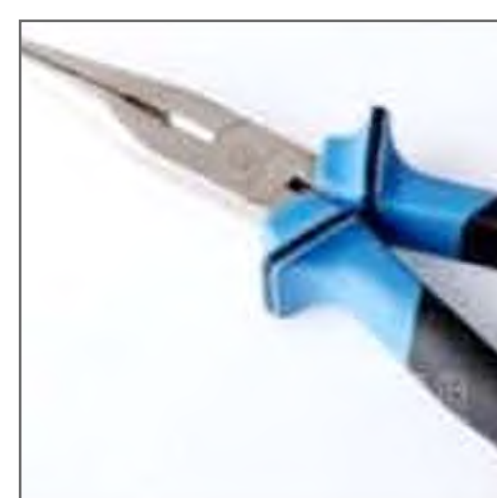
Needle nose pliers