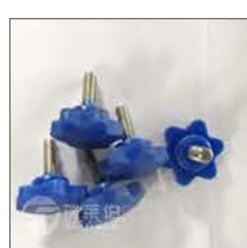
Star shaped handle