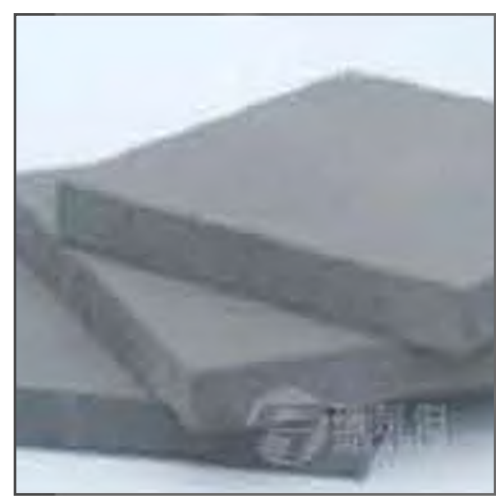
Press bottle foam