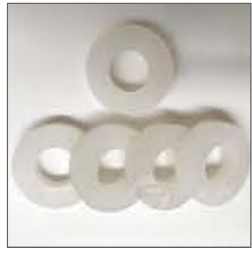
Gaskets for bottle neck