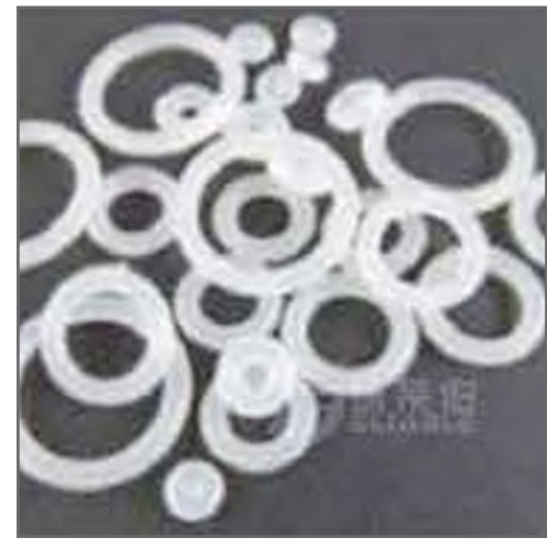
Seals for filling valve