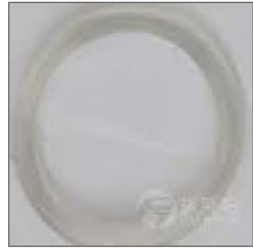
O rings for capping head