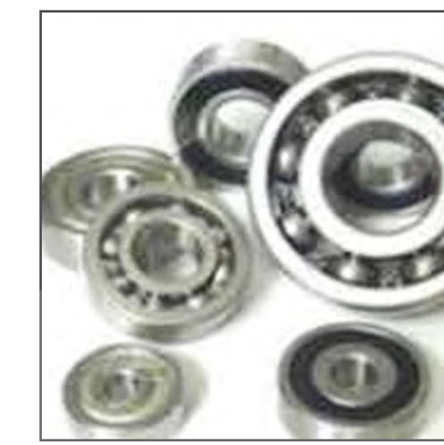
Whole sets of bearing