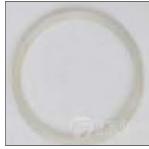
O rings for liquid tank