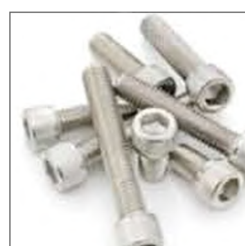
Allen key bolts&nut