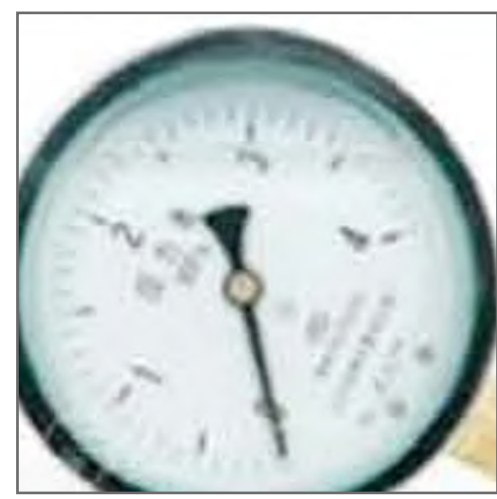
Pressure Gauge (Y100&Y60)