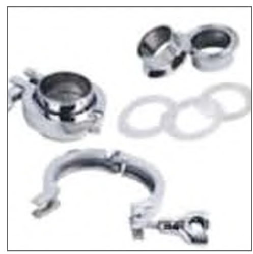
Quick couple seals