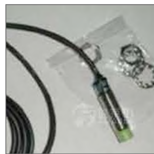
Film feed proximity switch